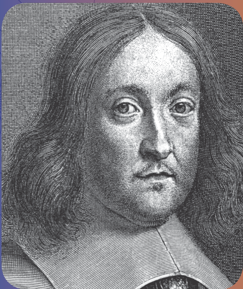
Pierre de Fermat